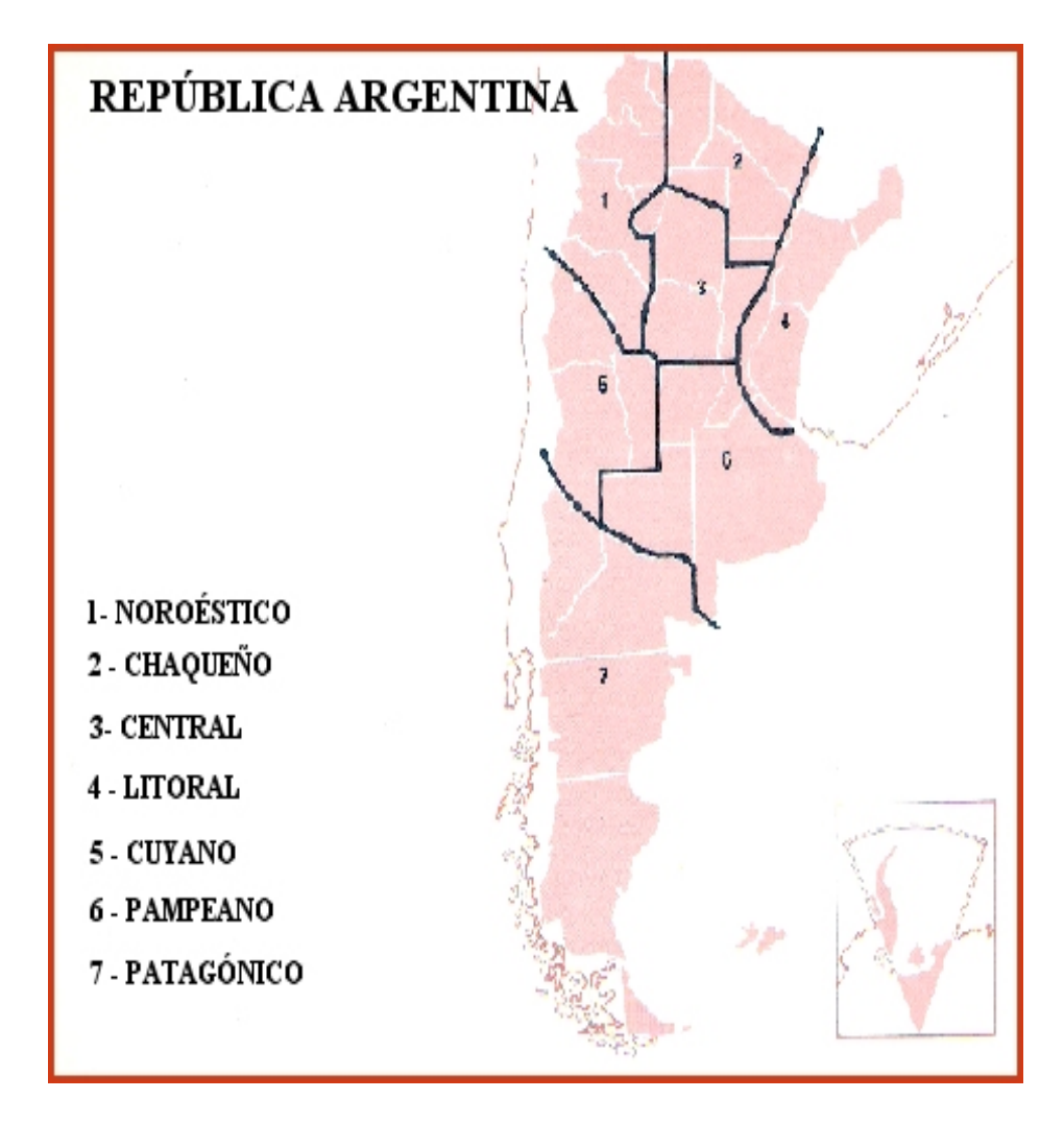
Figure 1. Geographical-folkloric boundaries of the Argentine Republic. <sup>33</sup>

The northeast region shares some characteristics with the northwest region, but incorporates a rhythm called chamame , played with accordion and the guitar. In the central region the rhythm of chacarera has grown to the point it has become one of the most important folkloric rhythms in Argentina. The instruments used are the acoustic guitar, a typical cylindrical drum called bombo , and in some cases the violin. Another strongly popular rhythm of the region is the zamba , which is an important Argentine dance and, as many others, has become an important popular music genre. The andean