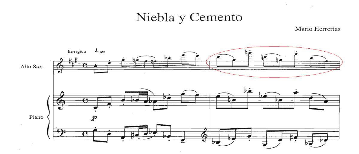
Figure 4. Beginning of Niebla y Cemento.

In Herrerías's piece, the influence of Piazzolla is clear in the rhythm; the regular 4/4 measure becomes a 3+3+2 in eight notes (see figure 4), incorporating the syncopated tension which is very common in music with popular roots.