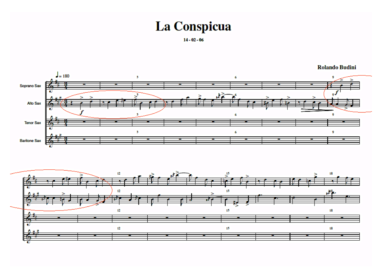
Figure 2. Measures 1-18 of La Conspicua.

In Fernando Lerman's piece Sonata para Saxofón Alto y Piano , the folkloric and tango influence are present in each of the movements. The first movement, Chacareroso , references the dance explained before. The second movement, Reo y Misterioso [ Indomitable and Mysterious ], shows the rhythmic syncopation characteristic of Piazzolla's music. The third movement, Huaino <sup>45</sup> con Acelere [ Huaino with