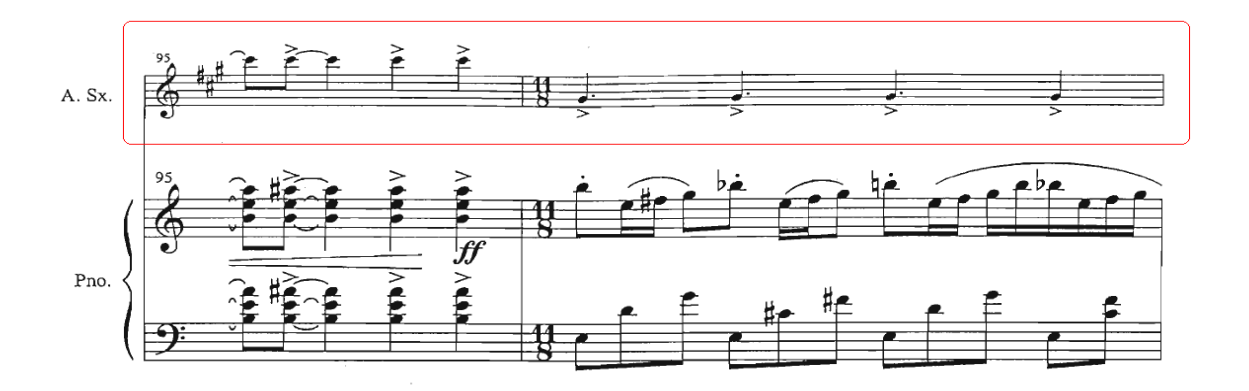
Figure 5. Measures 95 and 96 of Niebla y Cemento.

Herrerías finds in tango the local element that makes his composition recognizable as an authentic Argentinian music. With his composition, Herrerías gives to the performer the possibility of exploring tango style; his clear influence from Piazzolla could serve as a bridge for the saxophonist to explore more about this famous tango composer and about this authentic Argentine music. The teaching of tango in academies is still an issue to resolve. Imagine an Argentine professional saxophonist going to a World Saxophone Congress and someone asking him about how to play tango. His very possible answer will be "I have no idea, I passed all my years in school playing European music." Isn't tango the style people around the world recognize as the most characteristic Argentine music? Wouldn't it be important for the rest of the musicians around the world if Argentine performers, professionals or not, know the basics of how to play tango? 51